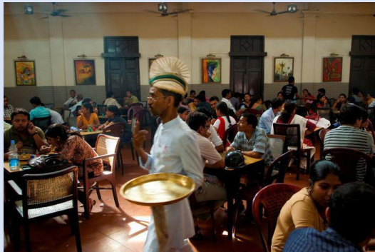
A view at the ambience of The Indian Coffee House

Located at College Street, this place is everyone's favourite 'adda'. Founded in the year 1876, this place still holds the same charm it did over a century back, Chicken 'Kaviraji', 'Mughlai Paratha', Chicken Sandwich, and Mutton 'Afghani' are highly recommended dishes. If you happen to be a coffee lover, infusion is going to land you straight in heaven with its deliciousness.