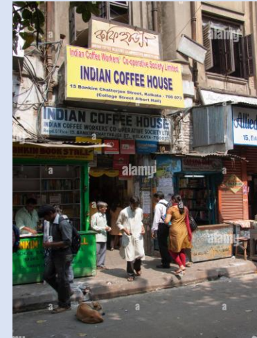
Indian Coffee House