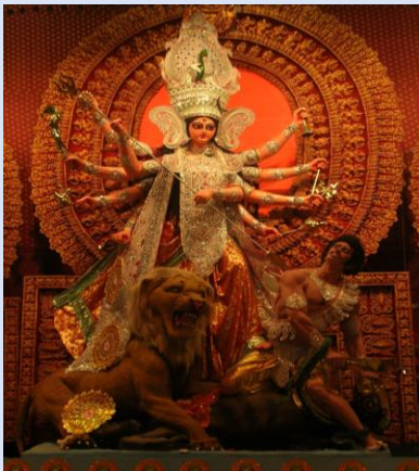
Idol of Goddess Durga in College Square