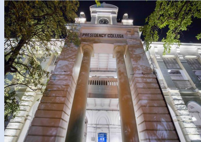
The Presidency University

The Presidency University, originally called 'Hindu College', started its eventful journey in 1855. The most striking feature of the Hindu College was its determined effort to impart secular education. It had also introduced courses in Law, Fine Arts and Engineering.